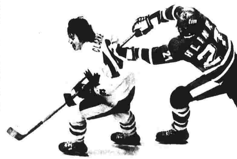
Canada's Bobby Clarke wins race to puck at Montreal. Czech forward Ivan Hlinka was unable to check high-flying center.

PINEHURST, N.C. (UPI) — It's been a bone dry year for Tom Watson as far as victories on the PGA tour go, but he doesn't blame anything, or anyone, but himself. "I haven't won a tournament this year because I haven't played well enough to win a tournament," said the 1975 Byron Nelson and British Open champ Thursday after grabbing a share of the first round lead in the $200,000 World Open. "It just simply hasn't been hitting the ball as well as I did last year." Watson tore up the par threes in Thursday's first round of the tournament over the 7,007-yard, par-72, Pinehurst No. 2 course for a first-