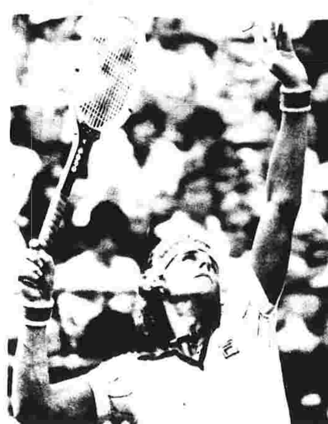
Bjorn Borg delivers serve. Suede, eliminated Manuel Orantes.

NEW YORK (UPI) — UCLA's first-year Coach Terry Donahue beat Arizona State's Frank Kush, but he's not about to gloat over it. "Their program will not fold," Donahue said after his Bruins soundly whipped favored Arizona State, 28-10, Thursday night, dampening the hopes of the seventh-ranked Sun Devils to claim the national championship this year. The victory also needed a 13-game ASU winning string. Kush, who has worked 18 years to gain recognition for the Sun Devils, was thoroughly disgusted after the nationally televised contest. "We had no offense at all, he said. "They completely intimidated us." He was not any more satisfied with the defense, which let the 14th-ranked Bruins ramble for 569 yards.