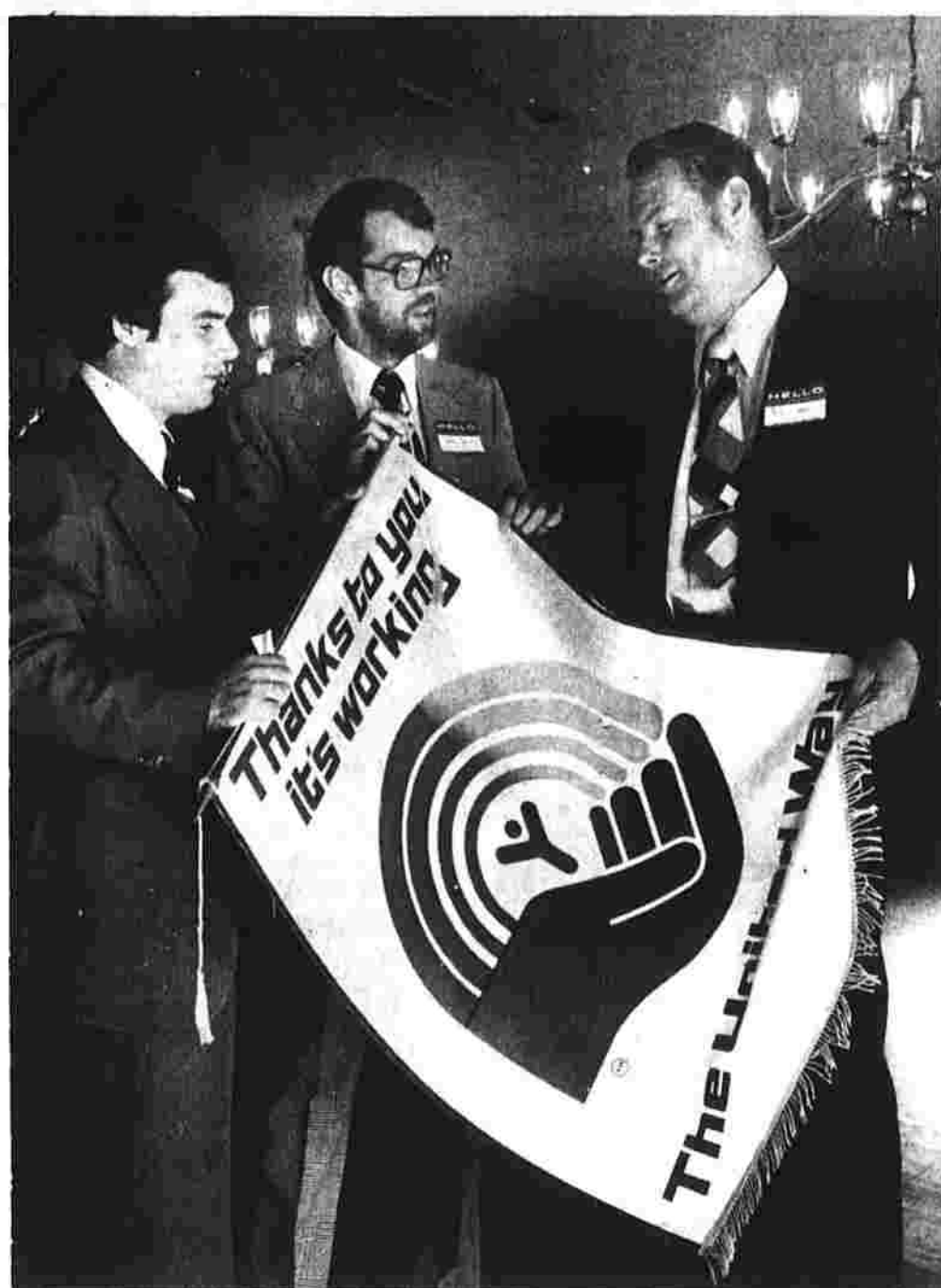
United Way officials hold banner

Mostly cloudy today, rain tonight and Saturday, ending Saturday afternoon. High today in low 70s, low tonight in 60s. High Saturday in low 70s. National weather forecast map on Page 2.