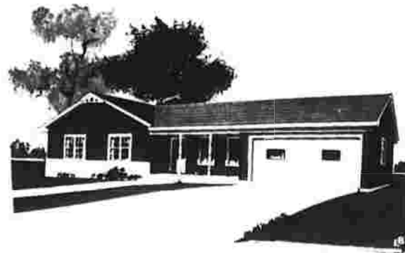
HOME HAS LARGE FAMILY ROOM RUSTIC THREE BEDROOM